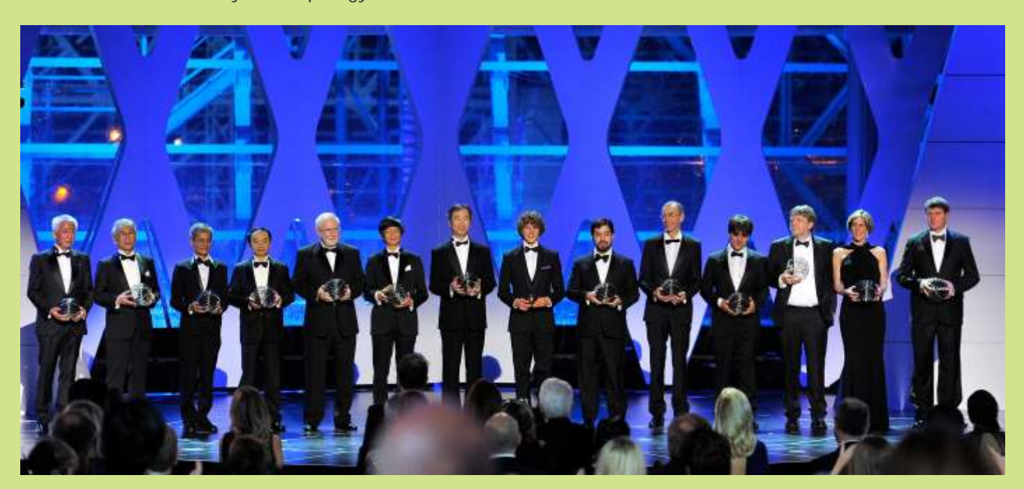
Recipients of 2016 Break Through Prizes

More information on the Breakthrough Prizes is at: www.breakthroughprize.org