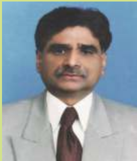
Secretary Lahore Chapter