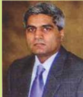
Secretary Peshawar Chapter