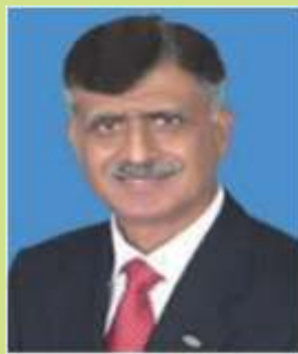
Associate Secretary General