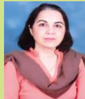
Secretary Karachi Chapter