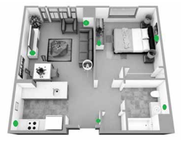
Fig. 1. Possible Placing of Bluetooth beacons (Green circles show BLE beacon placing)

It is the safest area in PWD environment in which presence of PWD is considered at resting position.