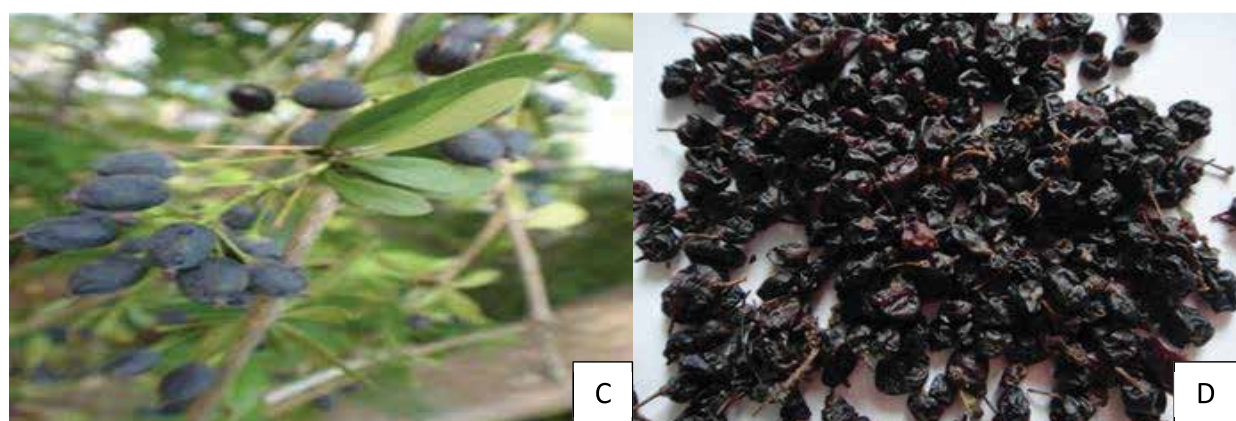
Fig. 2. Berberis lyceum (C: field photo D: Fruit)