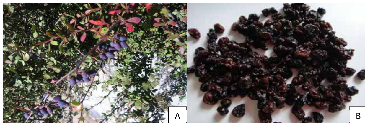
Fig. 1. Berberis aristata (A:field photo B: Fruit)