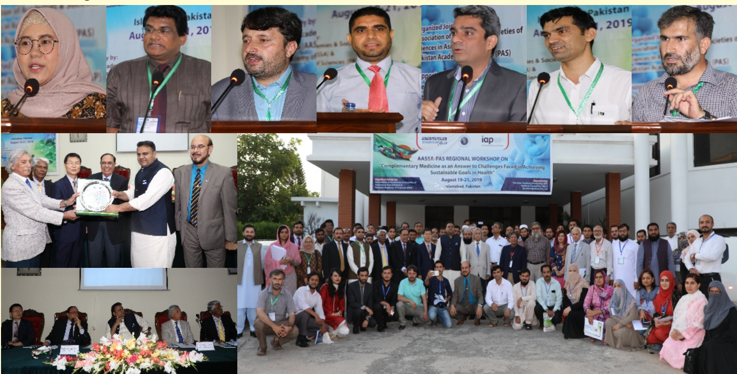
Speakers and Group Photo of participants with Chief Guest Federal Minister S & T, H.E. Chaudhry Fawad Hussain

3. Suppliers of medicines based on natural products must ensure that harvesting of the products from the animal/organisms species providing the source compounds is sustainable or the animals are domesticated in order to meet demands.