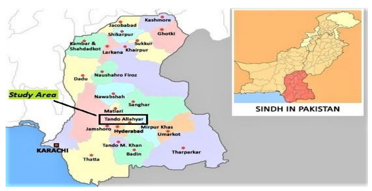
Fig.1. Map of the study area (District Tando Allahyar, Sindh)

preparation to harvest, as well as the materials required in the process. Cultivation costs include both variable and fixed expenditures. Nursery preparation, land preparation, transplanting, farmyard manure, fertilizers, irrigation, plant protection material, and its application, picking, operation-wise labour and utilization are considered variable expenses, whereas land rents are considered fixed costs. Several questions about production and marketing difficulties that farmers face are also included in the questionnaire. Future crop development recommendations and grower appraisals of prospects are also sought.